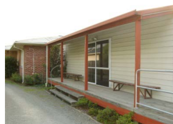
Our existing group room

The Friends of Petersgate, who number nearly 200, support us amazingly well every year and we are truly thankful for your support. You are a hugely important group and we hope you will feel encouraged to support this rather special appeal for 2009.