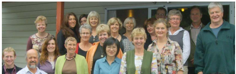
Our dedicated counselling team